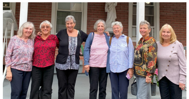
Below: "Academy Girls" of yesteryear!

Yearbooks and class photos dating as far back as the 1940's were on display. Current students offered guided tours to show off new developments at the school. The alumnae were delighted to see the many improvements and upgrades that have been made to the school over the years.