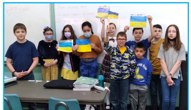
These Fifth Grade students at St. Joseph School, Baltic, CT are light in the darkness. They are raising funds for the people of Ukraine.